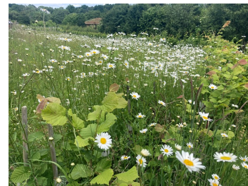
Wildflower meadow with hazel hedging: TTC