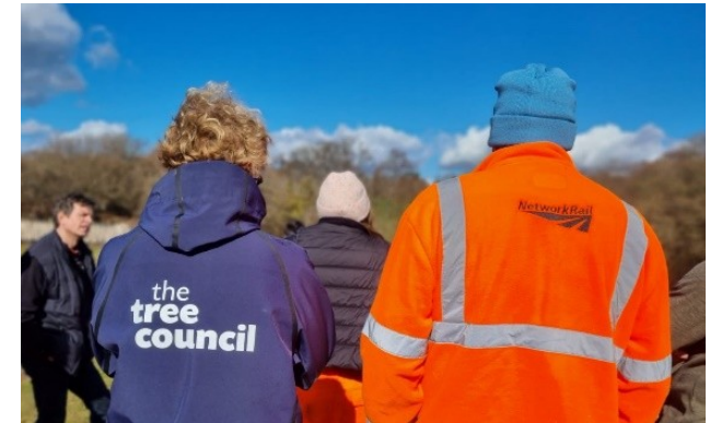
Working together for the love of trees: TTC

Responding to the survey, the local community worked with TTC to find sites across the district to increase hedgerow length and habitat connectivity. In addition, with support from NR/TTC, the community decided to increase fruit tree planting as a means of introducing additional, appropriately sized garden canopy cover, and to develop food resilience.