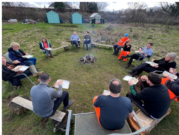
Campfire community: TTC

TTC's mission was to bring everyone together and provide the knowledge and tools for best-practice tree and hedgerow establishment.