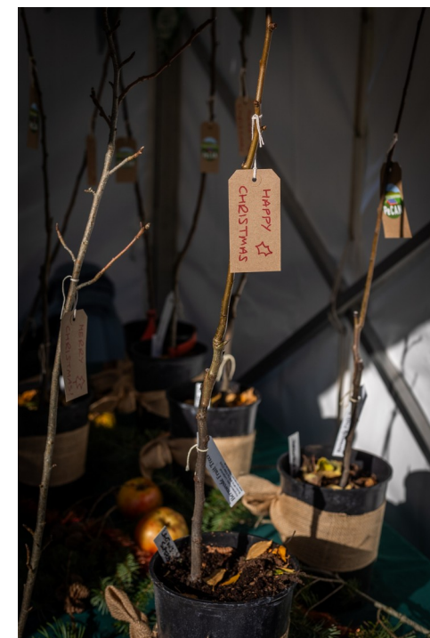
Christmas orchard trees giveaway: Tina Knowles