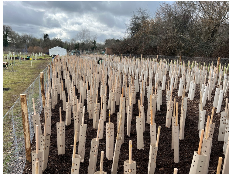
Miyawaki method Micro-Forest: TTC