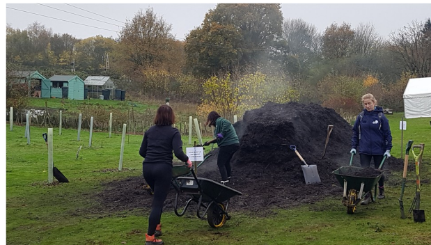
Steaming on with the mulch: TTC