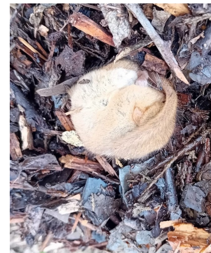
Beautiful little dormouse found snoozing in the mulch heap: Phil Paulo