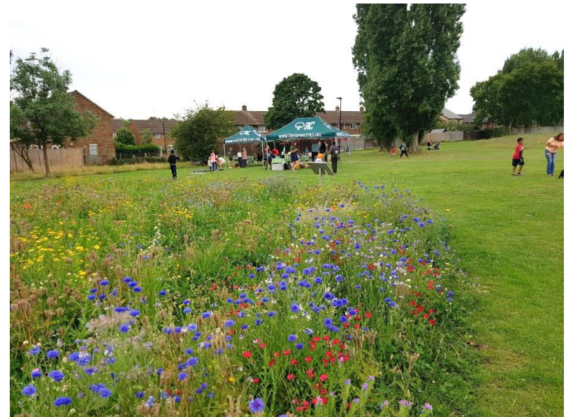
2023 - Wildflowers and Community Celebration