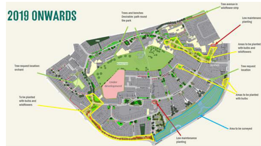
2019 – Racecourse Estate future plans...