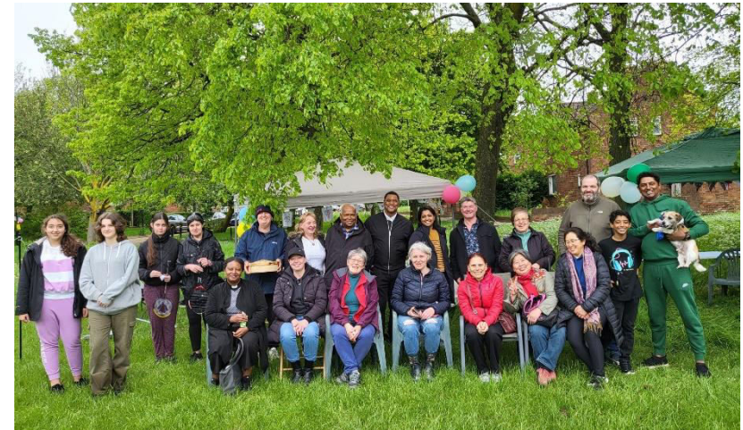
Spring 2023 - Green Shoots Community Greening Group

"I've always had an affinity with woods and trees, and felt very much that Trees for Cities have given a very good impulse to the area by planting trees, by getting people involved. So I felt it would be a shame for us not to take some positive steps from there to keep looking after the trees" Green Shoots member, 2023.