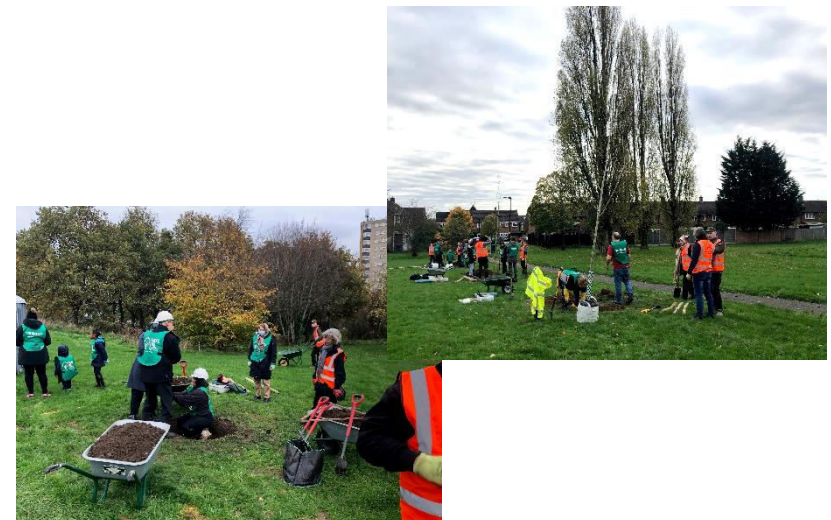
Winter 2022/23 Avenue Planting Event