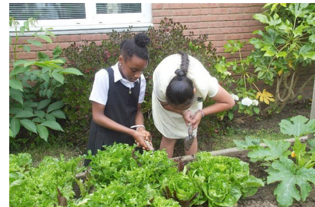
2021 – Harvest time at Petts Hill Primary School