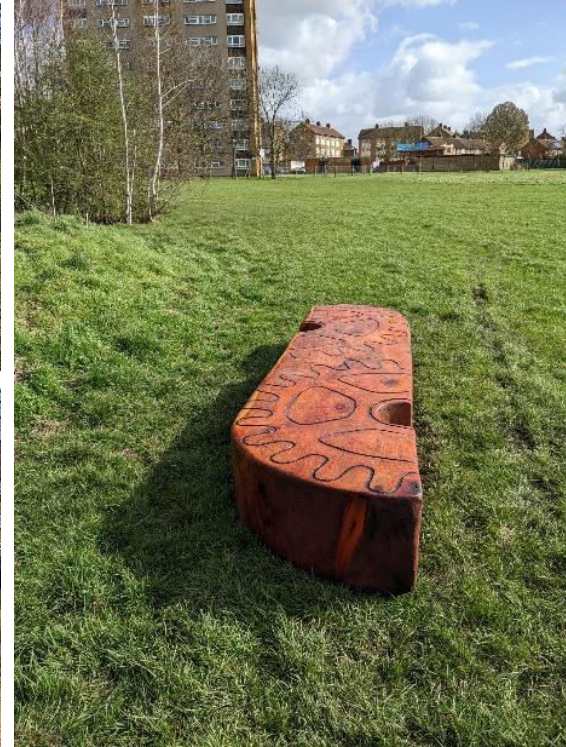
2021 – Tree Trim Trail and bespoke Seating