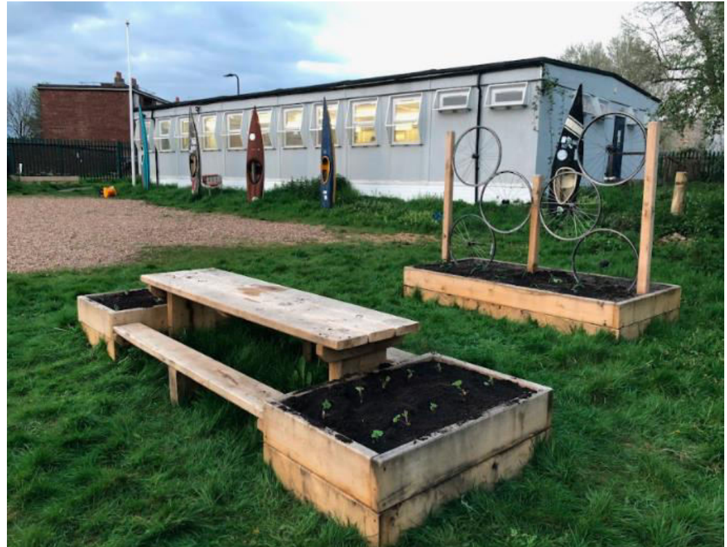
15 oak raised beds (for perennials and food growing) & 5 oak picnic benches