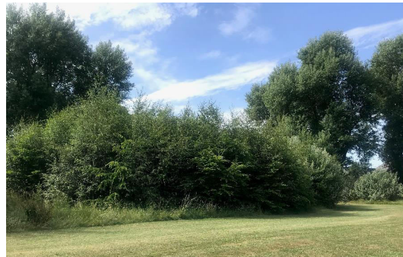
Northolt Park Woodland Community Planting 2013 & in 2023