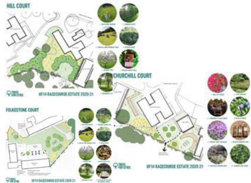
2021/2022 – Design Ideas for courtyards