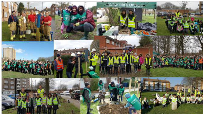
Racecourse Estate Community Greening Events 2016-2018

We informed residents and shared information on the benefits of trees, planting and maintenance, supporting ideas and decision making. Over 60 trees were planted, including a new community orchard.