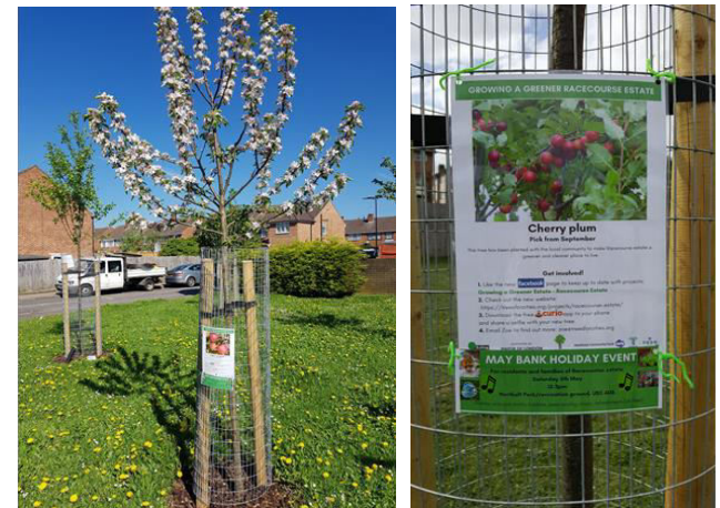
2020 - Community Orchard, Racecourse Estate

Ealing’s BAP vision states “Conserve and enhance habitats that create better, and more interconnected places for wildlife across Ealing” and, “Increase awareness of biodiversity and encourage more people to connect with nature and by doing so take positive actions that benefit biodiversity in Ealing.” A 2019 baseline survey captured the community’s connectedness to nature, alongside other metrics, the mean Index score was slightly higher than the national mean for adults, although 8% of residents scored as “low connectedness”.