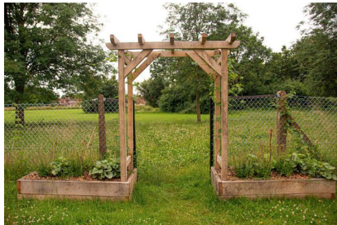
2 Oak Archways