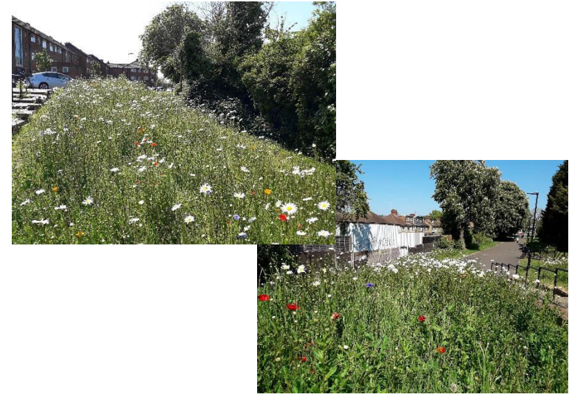
2020 – Wildflowers across the Estate, Planted By Ealing Council

Over a ten year period, there have been five interlinked programmes of planning, community engagement, tree planting and other greening interventions, each informing the next stage of delivery. TfC has become an increasingly familiar presence to residents on the estate where we have turned ideas into actions.