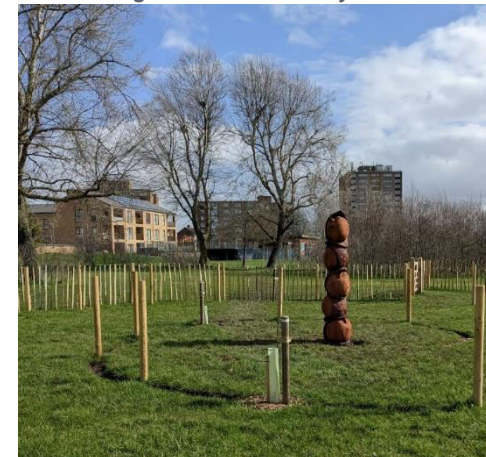
Spring 2023 – Spiral Orchard, Northolt Park