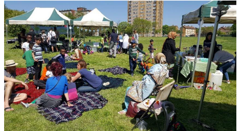
Summer 2022 – Racecourse Summer Tree Celebration Event