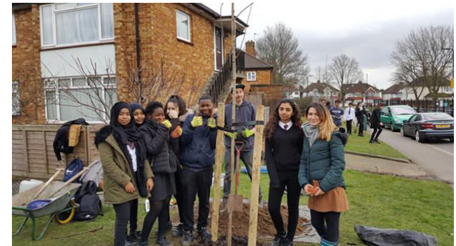
2018 - Local School tree Planting at Racecourse Estate