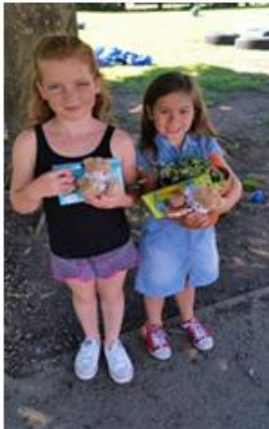
Proud bug hunter winners with their prizes

It’s important to engage with the local community and where possible educate them about their local environment in a fun but informative manner.