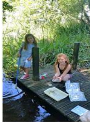
Pond dipping and bug identification