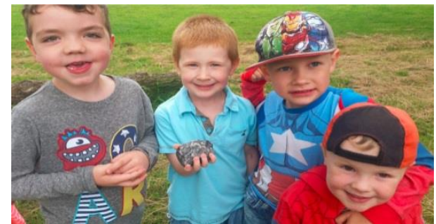
Photos of the family fun day held by Kier at the National Trust Tredegar House

As part of the Kier Strategy for a Sustainable Business We want to maximise the ‘Kier Effect’, which delivers social value from our projects by Supporting good causes and acting considerately in our communities.