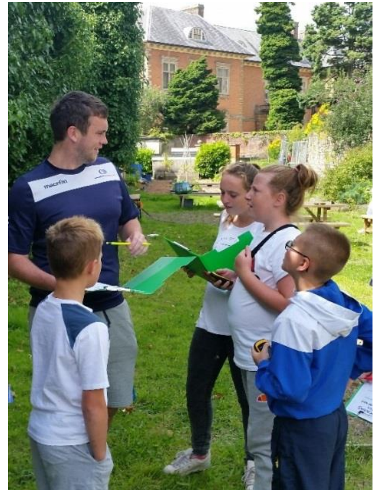
Green team 'Kickers' trying to unlock the geocache cryptic code